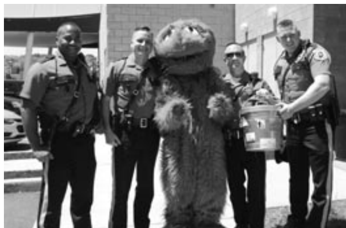
Monroe Township Police Officers posing with Oscar the Grouch at Clean Sweep Monroe.