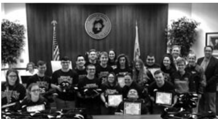
Unified High School Basketball Team - NJSIAA Group B State Champions