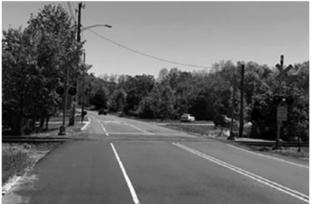
A westbound view of Schoolhouse Road facing the train tracks and Forman Ave., slated for improvement with funds from Monroe's largest-ever NJDOT grant.