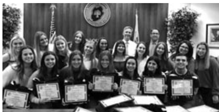
High School Cheerleaders - Division and Group 4 State Champions