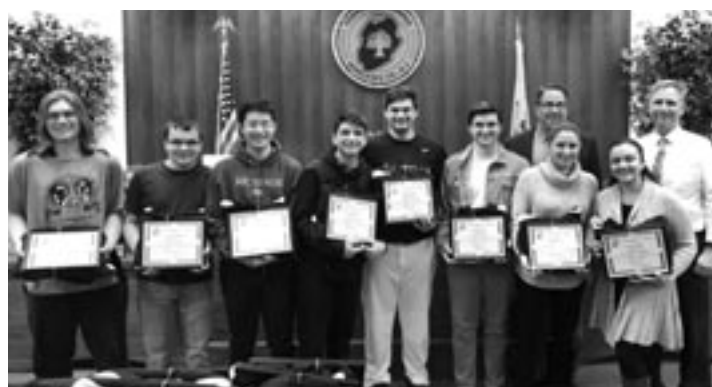
Boys Bowling - Central Jersey Group 4 Sectional State Champions