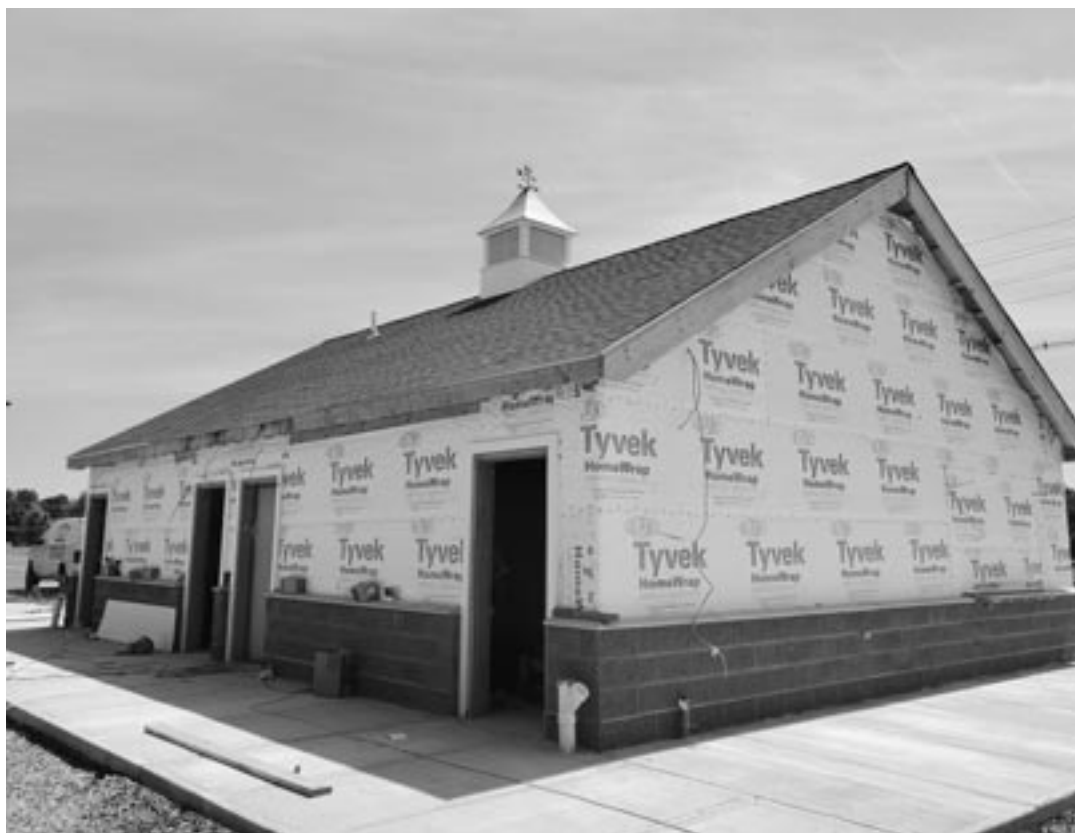
New concession stand and restrooms for the Daniel Ryan field and soccer complex.

Construction on the new concession and ADA restroom facility is almost complete. This highly-anticipated project will be ready to open for the Wolverine season.