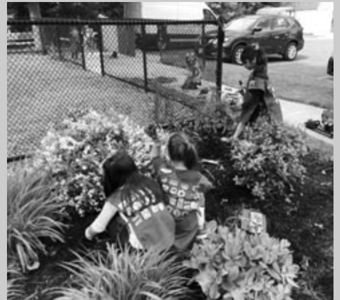
Members of Daisy Troop 83619 plant flowers at a garden at the Monroe Township Library.