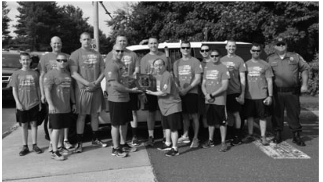
Members of the Monroe Township Police Department participated in the NJ Special Olympics Torch run on June 7.