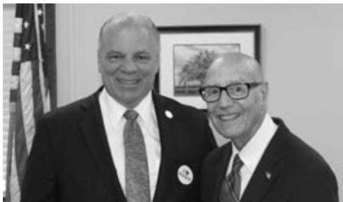
Senate President Steve Sweeney and Mayor Gerald W. Tamburro

In the future, many retirees may pay zero income tax under the new program. It is absolutely critical that this exemption reach $100,000 in 2020. We need to change the law so everyone gets the benefit of the first $100,000 exemption, no matter an