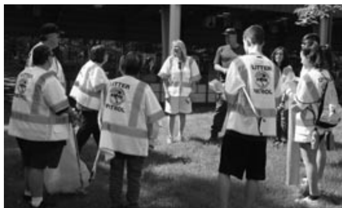
Litter Patrol at the inaugural Clean Sweep Monroe event on April 18.

The Clean Sweep Monroe initiative is supported by the New Jersey Clean Communities Council, Inc. (NJCCC), the 501c3 nonprofit that works closely with the New Jersey Department of Environmental Protection and the New Jersey Department of Treasury to administer the Clean Communities program. ■