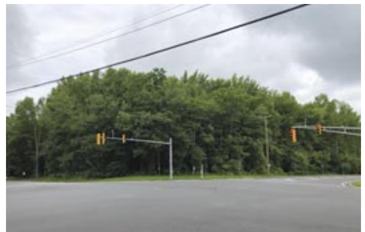
59 Acres at the corner of Perrineville Road and Federal Road to be purchased by Middlesex County. Acquisition moves Monroe closer to 50 percent of its open space preservation goal.