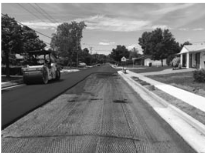
Monmouth Road Improvements Underway

Conrail has notified the Township that at-grade crossing repairs will be completed on Federal Road later this year. ■