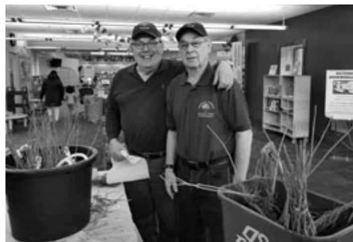
Members of the Shade Tree Committee distribute seedlings to visitors at the Monroe Township Library

For a list of all distribution locations across the state, visit www.forestry.nj.gov