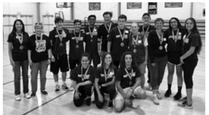
The winners of the Senior vs. Senior Games held on May 29.

“We are happy to have provided the venue for our high school seniors to enjoy a fun day and learn from our senior adult community,” she added. “The weather cooperated and a great time was had by all.” ■